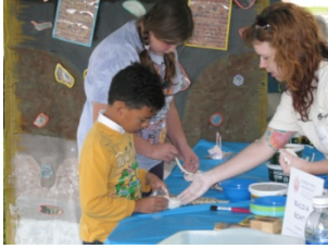
Children make coil pots at last year's Archaeology Month Kick-Off Celebration.